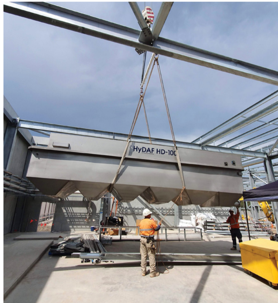
Standard HD-100 model being installed to remove metals from ground water following completion of major tunnelling project in NSW.

temperatures to rise by 2.2 degrees by 2070, meaning hotter maximums, harsher droughts, and more frequent and intense bushfires. The region is not alone, and the urgency is now critical for all councils across Australia to undertake comprehensive risks assessments and devise their own robust climate adaption plans.